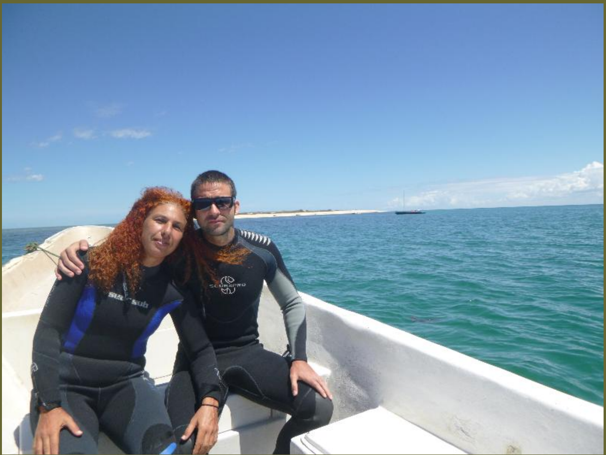
Max & I scuba diving off Nosy Be Island in Anakao